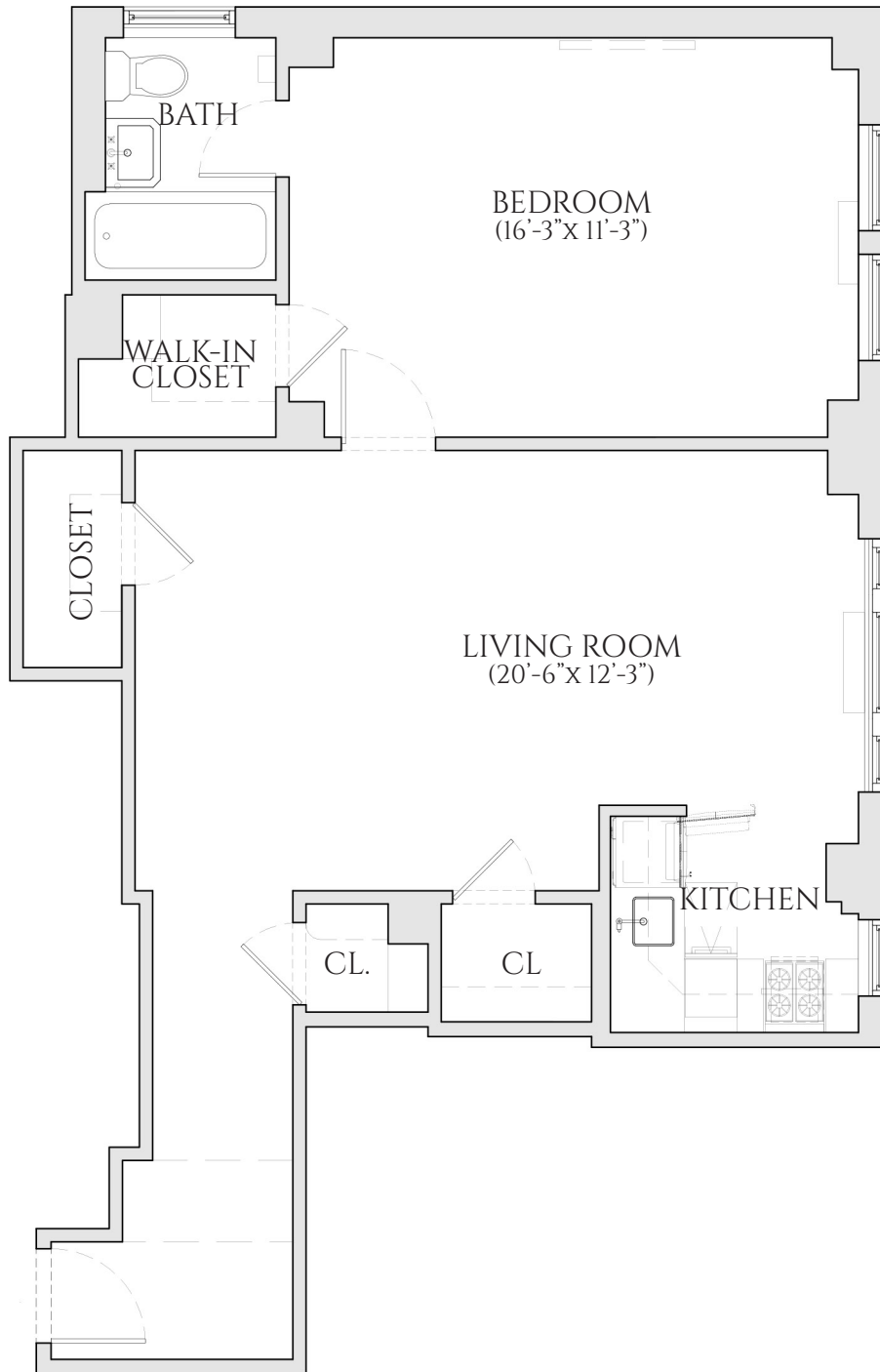
RESIDENCE 1229 ONE BEDROOM | ONE BATHROOM